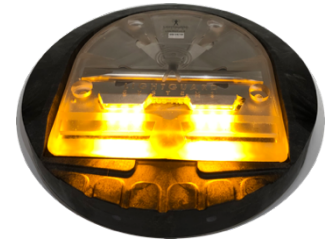
DAYTIME Amber Warning Lights