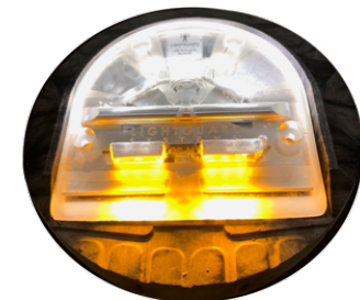
NIGHTTIME Amber Warning Lights & White Pedestrian Luminaire

The light fixture contains custom-engineered optics for precise focused light output using high-intensity LEDs. The fixture fits tightly into protective base plate models LGS-SD10-C and LGS-CHS-14. It fastens to each using stainless steel button head 1/4"-20 screws with thread locks and factory applied anti-seize compound.